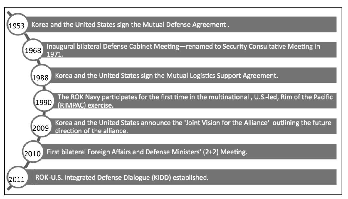
Figure 2: Development of defence diplomacy between Korea and the United States