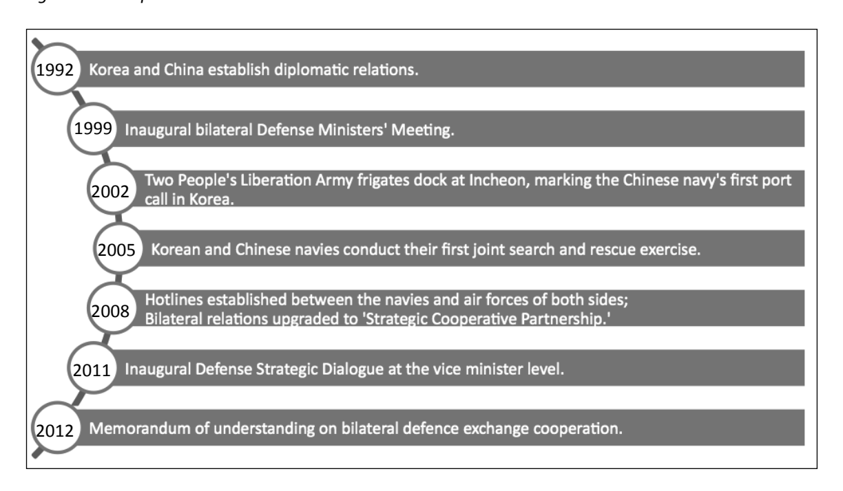
Figure 3: Development of defence relations between Korea and China